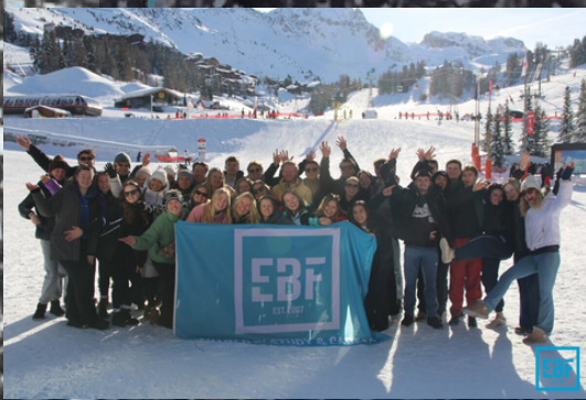
1. SKI TRIP

I'm looking forward to many events, but if I had to make a top three, Ski Trip would definitely be at the top. In just two weeks, we're leaving for Risoul! I've never skied before, so I'll be taking lessons and doing plenty of après-ski, but it's promising to be an amazing week with the board, the sports committee, and of course the EBF members.