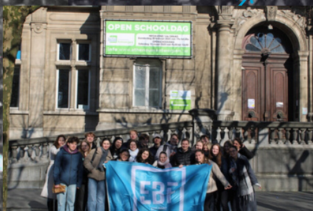
3. FIRST YEAR TRIP