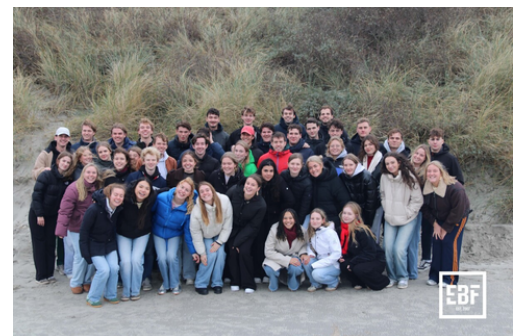
ACTIVE MEMBERS WEEKEND