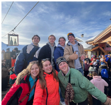
3. SKI TRIP

And of course, the EBF Festival is also one of my favorites. With good weather, music, drinks, and an amazing atmosphere, it's always the perfect way to celebrate together and enjoy the end of the year.