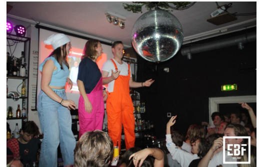
EBF CONFERENCE BOARD ANNOUNCEMENT