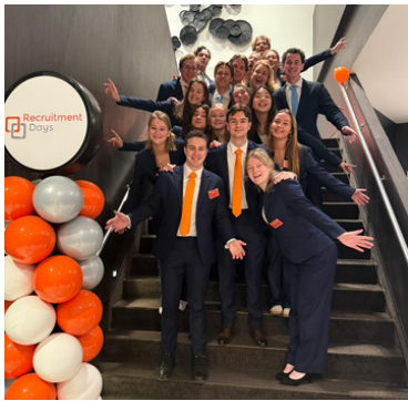
1. RECRUITMENT DAYS

If I had to pick my top three, they would be the Ski Trip, the Recruitment Days, and the EBF Festival.