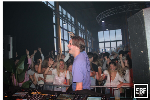
2. EBF FESTIVAL